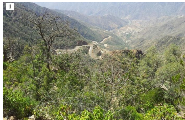
Fig. 1. Type locality of Parageron raydahensis sp. nov. in Garf Raydah Protected Area, Abha, Asir Province, southwestern Kingdom of Saudi Arabia.

Juniperus procera Hochstetter ex. Endlicher, Acacia etbaica Schweinf, Olea spp., introduced cactus species and many other Afrotropical trees, including Nuxia oppositifolia (Hochst) Benth., Maesa lanceolata Forssk, and Celtis africana Burm f. that grow in mesic gullies (Ghazanfar and Fisher, 1998) (Fig. 1).